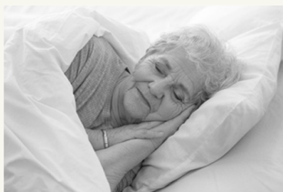
Not an actual patient.

Sleep disturbance is a common problem for people with PD. Poor sleep can affect health, mood, and overall quality of life, so good rest is important.