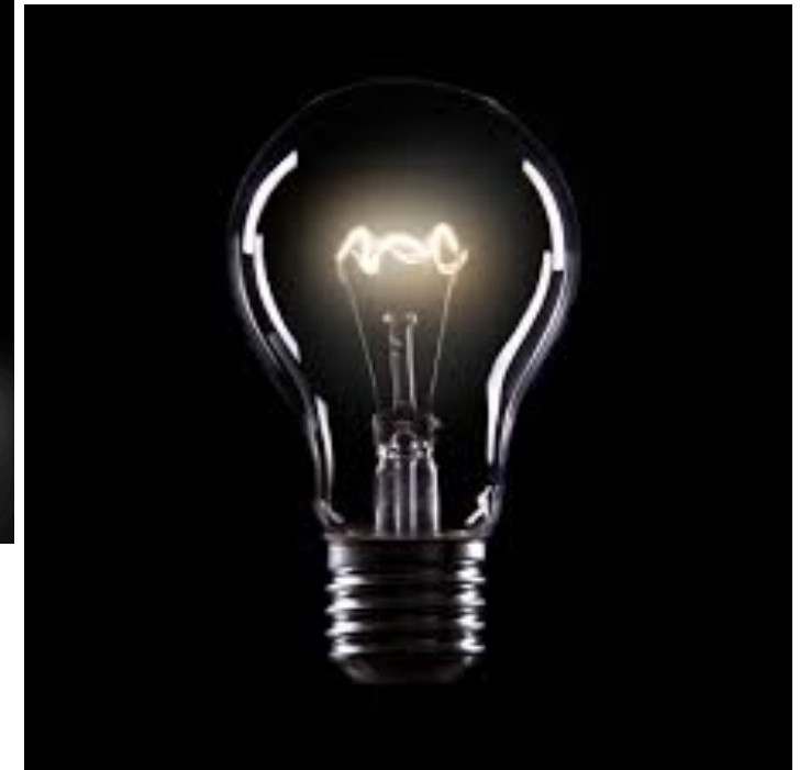
Incandescent bulb (below)