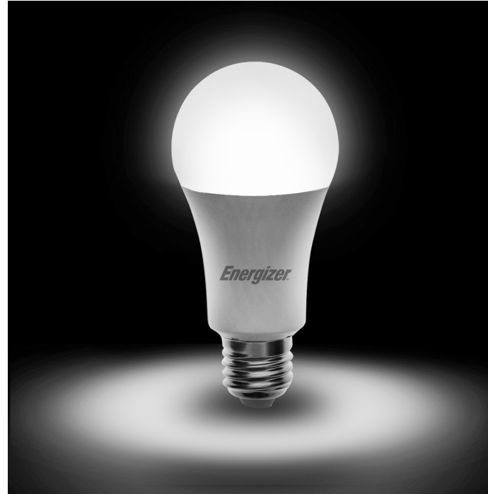
LED bulb (above)